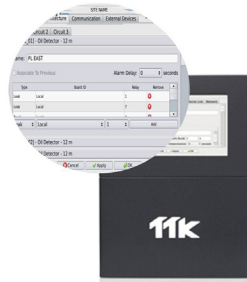
Easy setup of relays for each cable