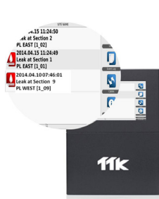
Simultaneous alarms displayed on one screen