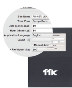
User-friendly interface of configuration