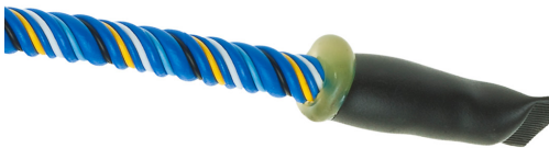
FG-ECS Sense Cable End Termination Tip

2 Communication Wires and 2 Wires for Locating