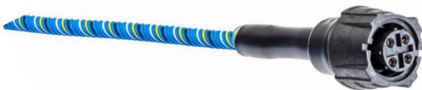
FG-ECX Sense Cable Female Connector Tip

2 Communication Wires and 2 Wires for Locating